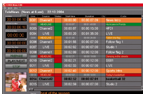
V-BOX News playback interface